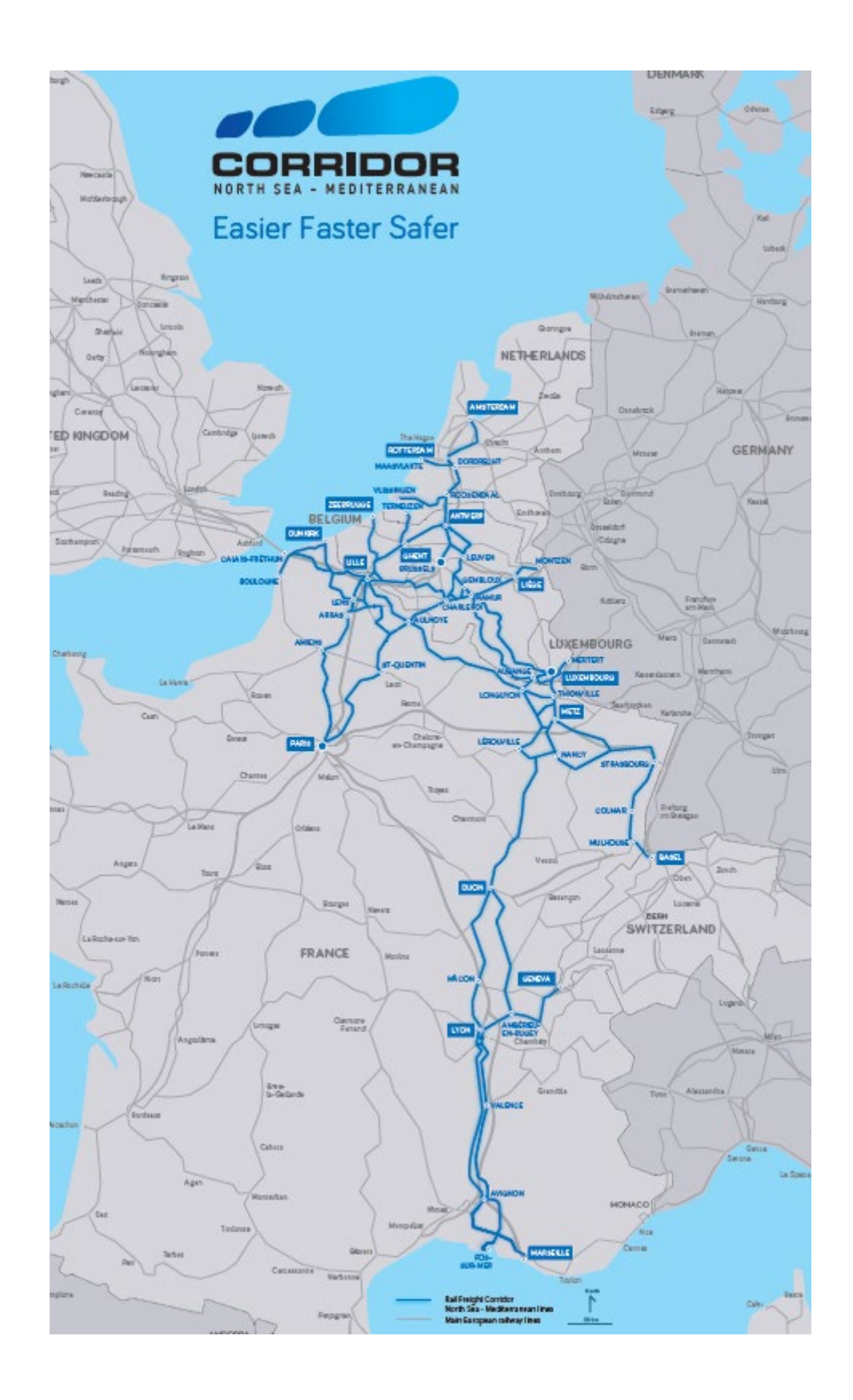
1 January 2021