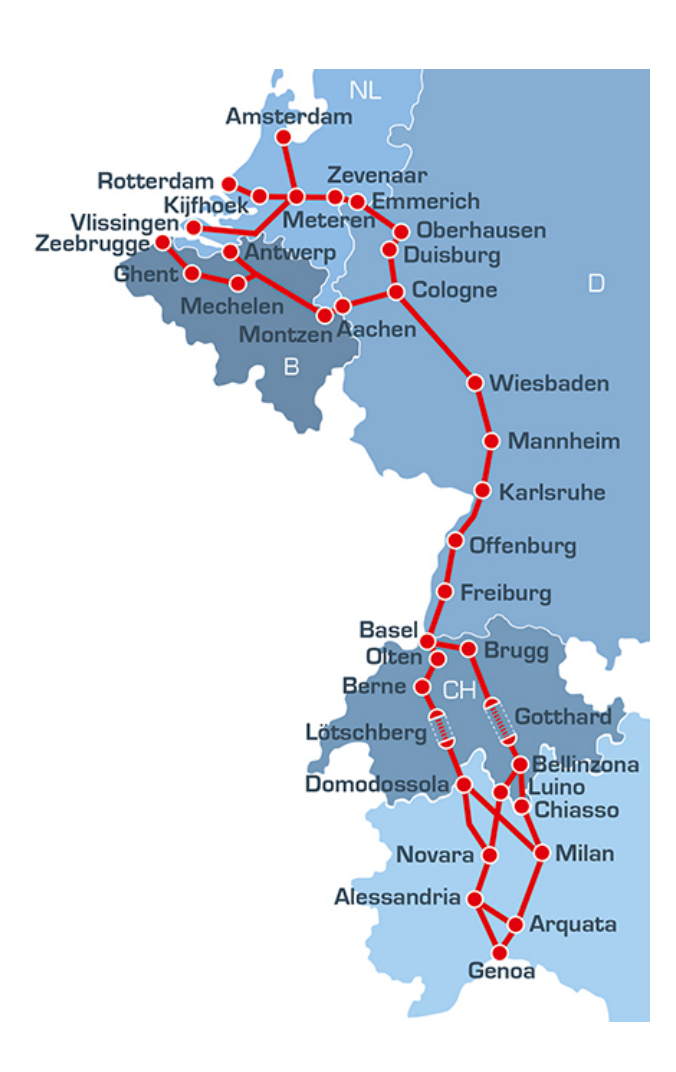
1 January 2021

Email: info@corridor-rhine-alpine.eu Website:www.corridor-rhine-alpine.eu